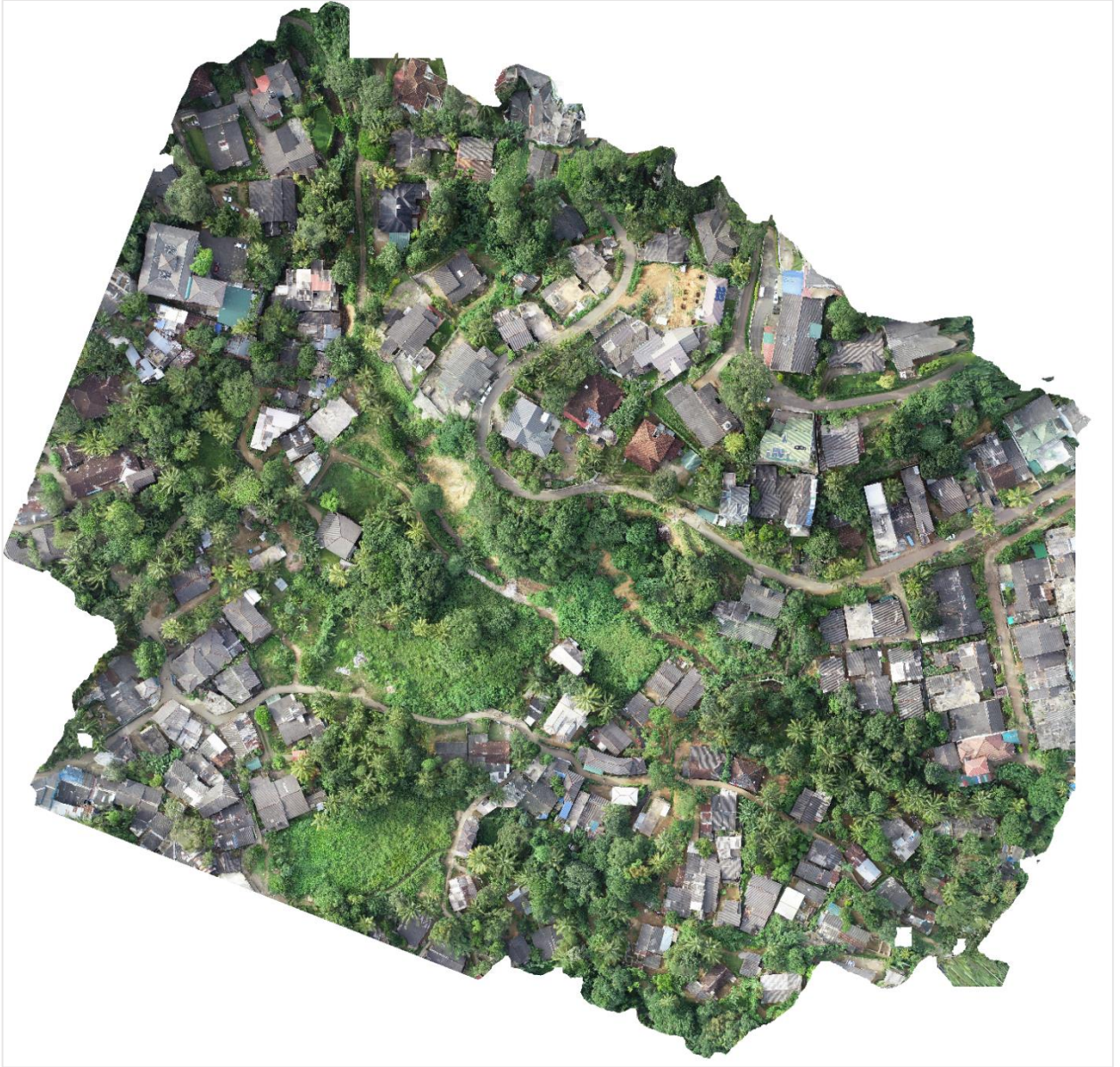
Fig 2: Drone image of the site