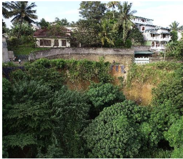
Fig 3: Exposed surface of failed slope on the upslope

Slope failure was occurred on May, 2016. During the torrential rainfall large soil mass is unstable and tensional crack had been developed alongside of the road and failure was happen extending up to about 100 meters and creating the 700 Sq.m slope area. The lower circular road run along a hilly area having a slope gradient of about 45°- 50° towards south eastern side. This road situated in south slope of wide valley. 7 houses are identified as vulnerable to slope failure which are situated in below slope.