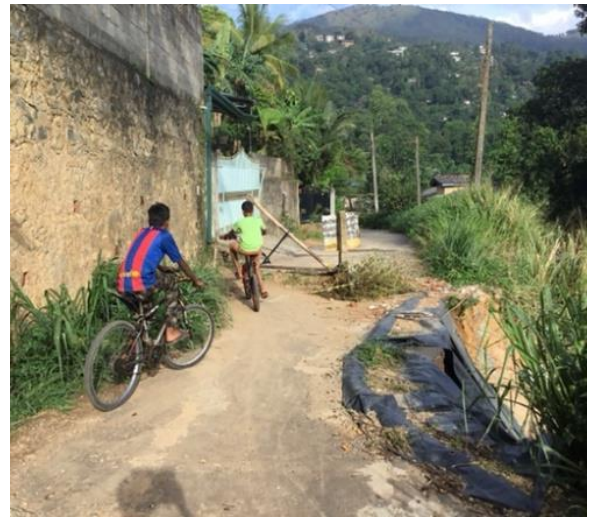
Fig 4: Damaged road due to slope failure