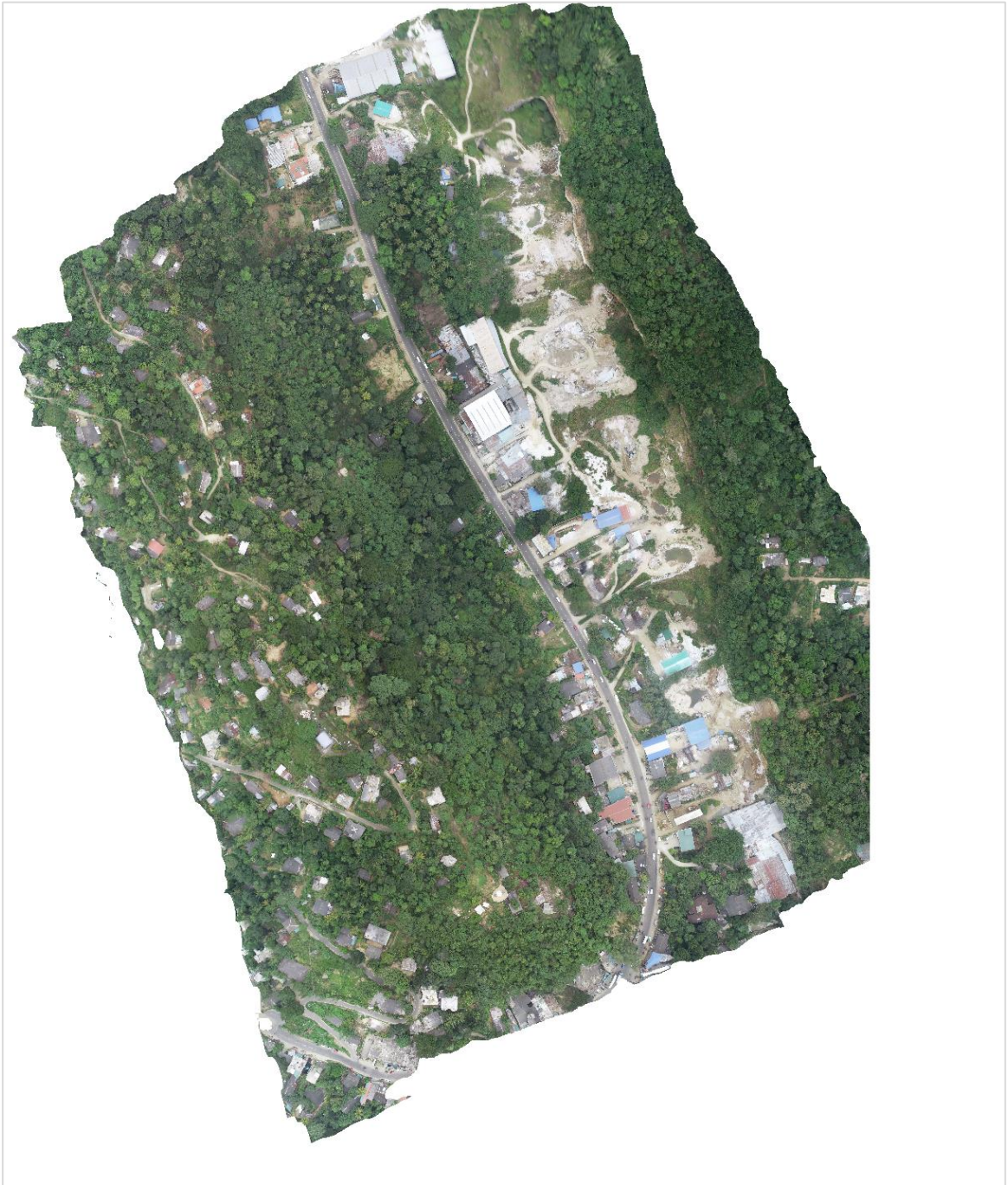
Figure 2: Drone image of the site