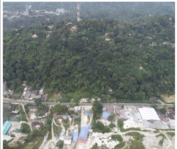
Figure 4: Location of road and houses in potential slope failure area