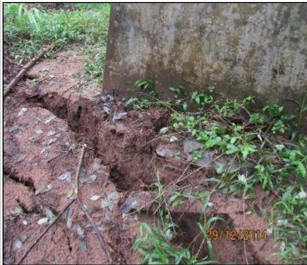
Figure 3: Exposed surface of failed slope

A failure occurred on December 26 th , 2014 in this location covering an area of 12500 m 2 , causing 20 households to resettle. There is a high possibility of reactivation of landslide at this location during high intense rainfall. Because of landslide activation during the past it disrupted traffic movement along the Kandy- Mahiyangana A26 road.