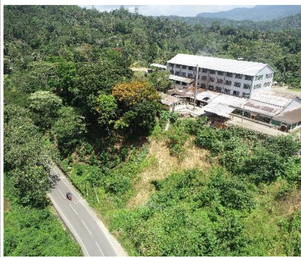
Figure 3: Slope failure along Galle - Deniyaya road

With the heavy rain on 25.05.2017 the down slope of the road has collapsed with a part of the road. Slope failure is possible under extreme weather conditions as surface run off is directed to the collapsed slope due to blocking drain. Part of the road already collapsed, locate at higher risk for future slope failure. As the house is locate closer to the unprotected earth cut, the householders and the house itself are at higher risk. Non-structural mitigation measures are not capable of preventing or minimizing future failures.