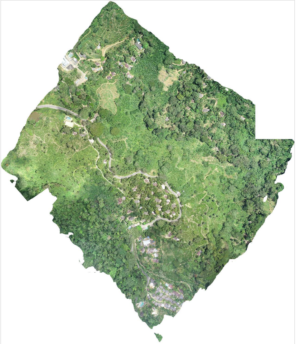
Figure 2: Drone image of the site