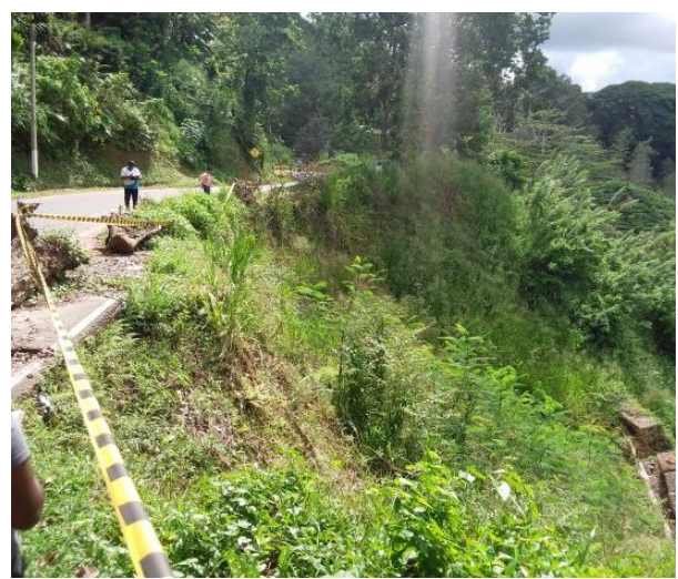
Figure 4: Damaged to road due to slope failure