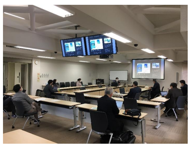
The Project RRLL interim meeting at Collaboration Research Hub, DPRI, Kyoto University (keeping distance)