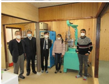
01st floor for lab with testing apparatuses