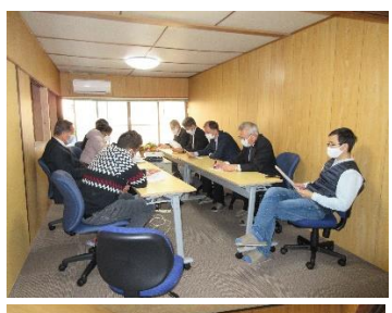
02<sup>nd</sup> floor for office

The opening ceremony for the new ICL/SATREPS Office was held on 14<sup>th</sup> December 2020. The spick-and-span new office, which has been remade from an existing old wooden Japanese house, is not only the project office but also a venue particularly for young scientists from Sri Lanka to pursue their new research challenges with also brand-new testing apparatuses.