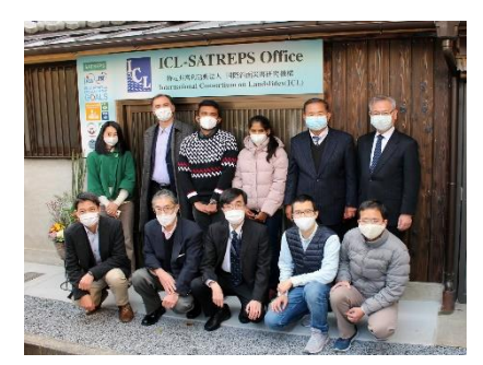
Entrance of ICL-SATREPS office