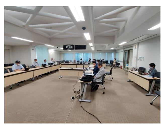
The 3<sup>rd</sup> JCC Hybrid Meeting at Disaster Prevention Research Institute, Kyoto University